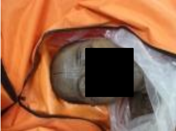
Fig 1 . Step of anatomical dissection I: A line is drawn on midline, through glabella-highest point of the nose-phiral groove-thyroid gland