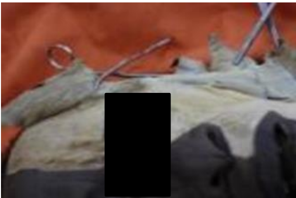
Fig 2. Step of anatomical dissection II : Incision continue from midline to lateral with separation of the layers, flapping from midline to lateral. Subcutis is separated from SMAS part from the lower part. Flapping is performed until the lateral.